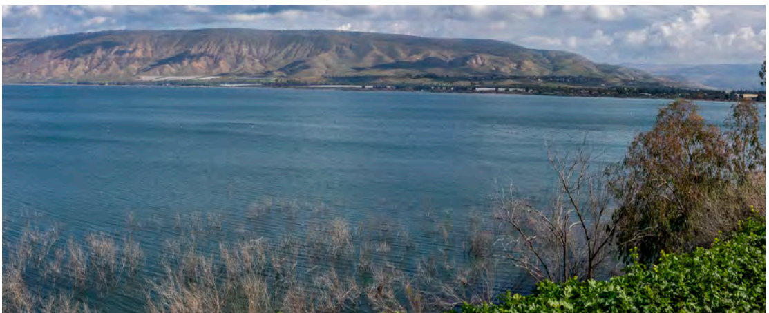
BELOW (VIEW EAST): THE SOUTHEASTERN SHORE OF THE SEA OF GALILEE. THE START OF THE YARMUK CANYON IS ALSO VISIBLE ABOVE THE SOUTHERN PLAIN (TOP RIGHT).

Why do I mention running? Because it was part of the experience. Getting the pictures I wanted that