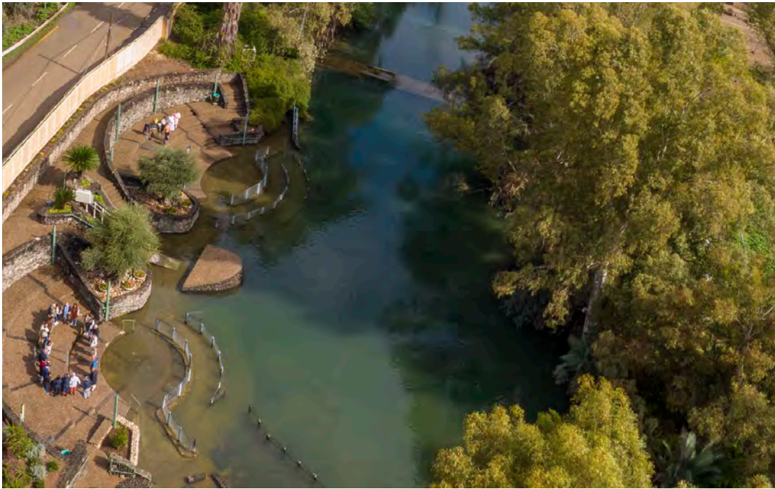
VIEW EAST: AERIAL PHOTO OF YARDENIT WITH THE JORDAN RIVER BAPTISMAL SITES. I BAPTIZED MY EIGHT-YEAR-OLD SON HERE WHEN WE LIVED IN ISRAEL AS A FAMILY FORTY YEARS AGO.

provide so many memories now required a sacrifice. I had to forget the backpack’s weight, my fatigue from a long day of moving quickly from spot to spot to achieve my objectives, and my lateness in returning to the rendezvous point. I did my best to get there on time, but I couldn’t pass up near-perfect opportunities to get images that capture the land in a special way.