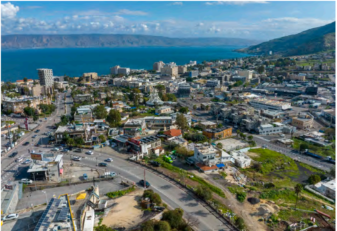
VIEW SOUTHEAST: TIBERIAS AND THE SEA OF GALILEE. THE CENTRAL BUS STATION IS ON THE RIGHT SIDE BEHIND THE DARK BUILDING. THE SHORTCUT WAS THROUGH THE FIELD (BOTTOM RIGHT).

Second, I remember particular moments in the day. For example, on my way to the central bus station in the morning, I crossed an empty lot next to a yellow gas station. It was still early, and the view of Tiberias was spectacular, so I stopped to take pictures. I note the gas station because it was near the shortcut I took on my return when the sun was behind me. I knew the photos would be better than in the morning. I got a good view looking across Tiberias toward the eastern shore of the Sea of Galilee ( above ). It was getting late, so I ran from there to catch my ride back to Haifa.