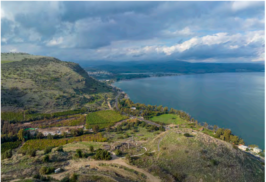
VIEW NORTH: THIS PHOTO LOOKS ACROSS TEL RAKAT AND THE RAKAT VALLEY TOWARD THE NORTHERN SHORE OF THE SEA OF GALILEE. HALFWAY AROUND THE SHORE WAS THE CITY OF ANCIENT CAPERNAUM.