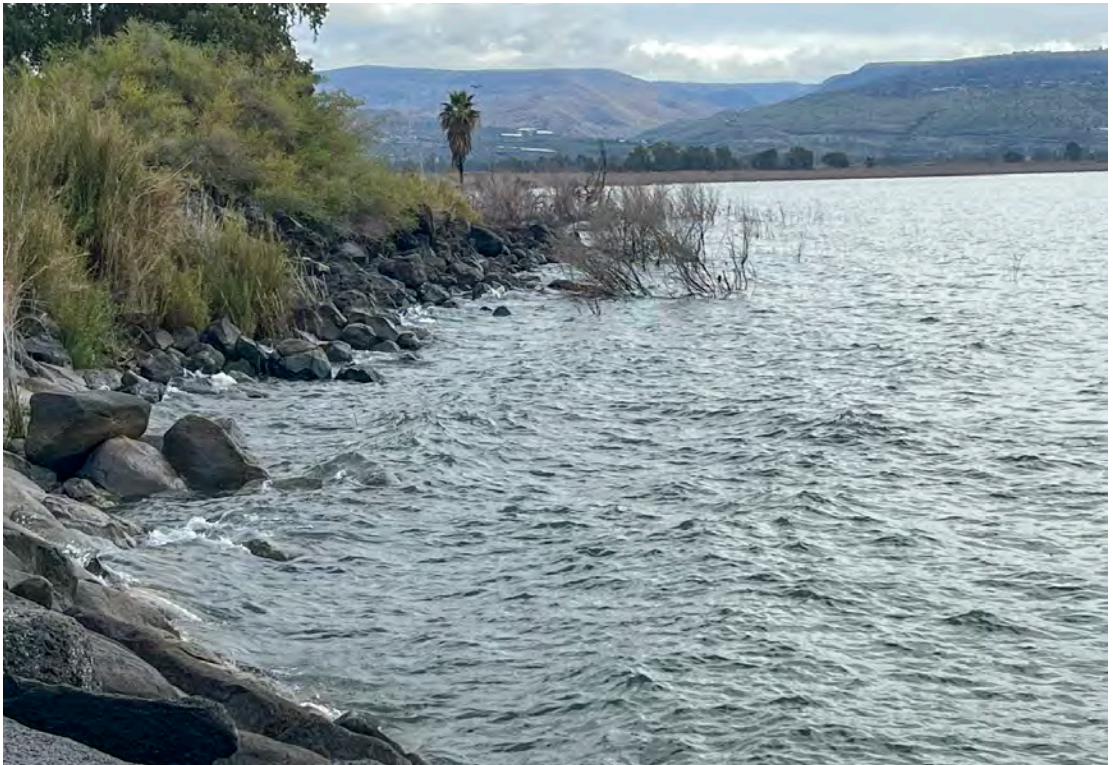
VIEW EAST: THE NORTHERN SHORE OF THE SEA OF GALILEE, LOOKING TOWARD GAMLA AND THE GOLAN HEIGHTS. THIS PHOTO WAS TAKEN IN THE AFTERNOON ON A WET, RAINY DAY.

and stay on task, remaining true to their mission? Where did they find shelter after ministering and teaching all day? I thought of a passage from the Book of Mormon that reflects on several ways Christ suffered during His mortal ministry and on the cross of Calvary: “And lo, [Christ] shall suffer temptations, and pain of body, hunger, thirst, and fatigue, even more than man can suffer, except it be unto death; for behold, blood cometh from every pore, so great shall be his anguish for the wickedness and the abominations of his people” (Mosiah 3:7).