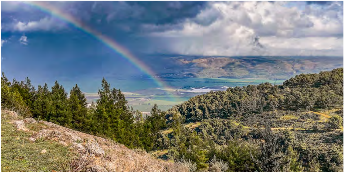
VIEW EAST: THE UPPER JORDAN VALLEY FROM UPPER GALILEE DURING A BREAK IN THE RAIN.

got off the bus. You can hear and see the rain in the video with me saying, “Well, this is going to be an adventure. It’s going to be a great day!” And that’s how you have to look at every day in the Holy Land regardless of the weather or how uncomfortable you are. Trust me; it’s all about the experience! You want as many as you can get. You want to feel the heat. Be grateful if you’re lucky enough to be out when the rain is coming down in torrents and you have nowhere to go. Why? Because as much as possible, you hope to experience what Jesus and His disciples went through in all kinds of weather, at all times of the year: “And it was at Jerusalem the feast of the dedication, and it was winter” (John 10:22). Why did John think it important to tell us it was winter? I like to think it was to help us relate Jesus’s daily life and challenges a little more with our own.